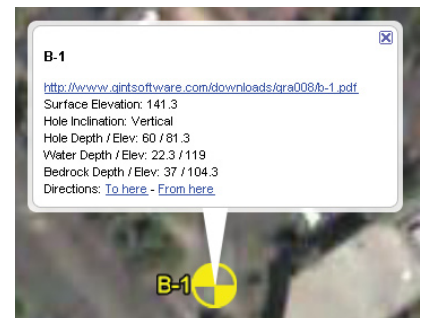
Click icon to display borehole details

We can assist you in any Google Earth customization or development of gINT Rules code customized to your specifications.